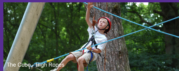
The Cube, High Ropes

... a place where young people will find inspiration, adventure, challenges and friendship, all within a safe, supportive and positive environment. Located in 95 acres of meadow, woodland and large fields, it nestles in the Hertfordshire countryside, surrounded by fields and country lanes, serenely belying the fact that it is on the edge of bustling Hemel Hempstead with Watford just five miles away. Easy transport routes from M25 and M1 make this a perfect place for your next adventure.