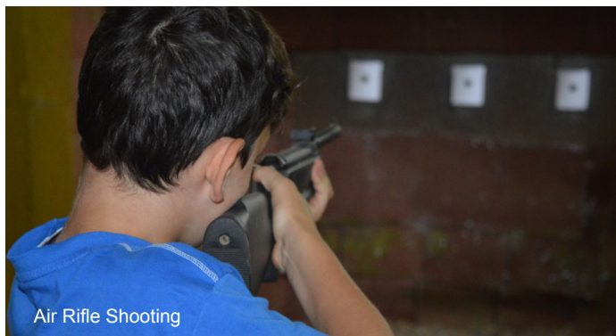
Air Rifle Shooting

Open every Sunday afternoon serving a range of hot drinks and snacks. A perfect place for additional parents to relax whilst the party takes place.